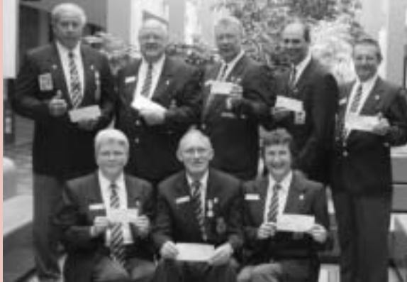
Representatives of the Royal Canadian Legion Zone A-7 and area Branches presented $10,000 for the purchase of equipment items in the 'Home Sweet Home' Appeal. Their gifts sponsored an Echo Bed, used to obtain high quality echocardiography ultrasound pictures of the heart, and Geri Chairs, providing safe and comfortable seating for patients